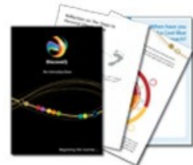
Workshop Journals and Practitioner Guides