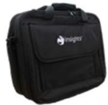
Insights Laptop Bag