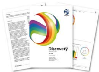
Your own unique Insights Discovery Personal Profile